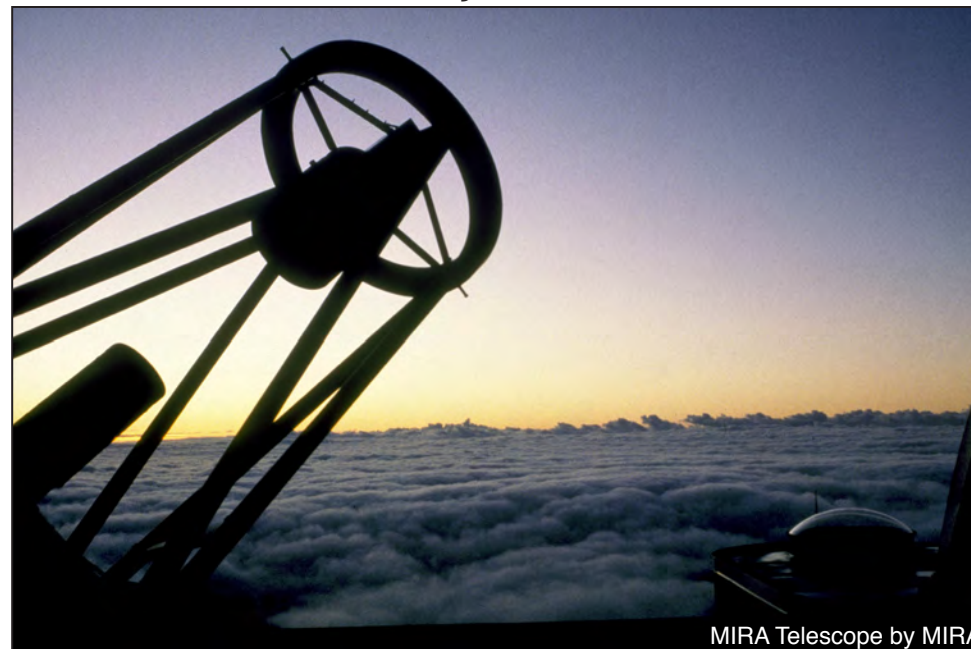
MIRA Telescope by MIRA

mirror in Paso Robles in 1977. The six graduate students who founded MIRA wanted to seek private funding and pursue useful projects that might not get done at a university with its emphasis on "publish or perish." Unfettered by an institutional location, they chose what they felt was the best site for optical astronomy in the continental United States.