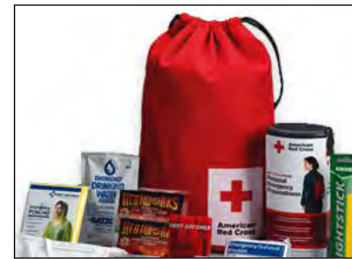
Sample preparedness kit