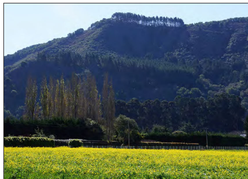
Saddle Mountain