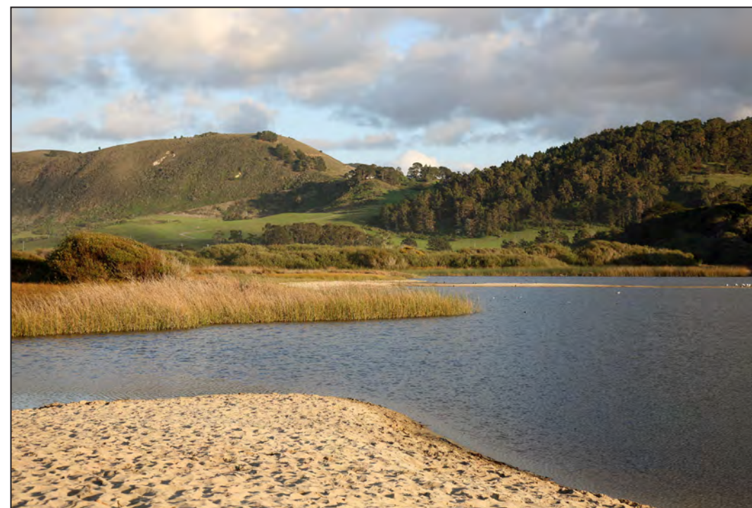
Carmel River Lagoon

The traditional role of comprehensive watershed stewardship by the Monterey Peninsula Water Management District further persuades us to vote for Measure O. The public interest jurisdiction of the district is essential for our water-scarce area. And