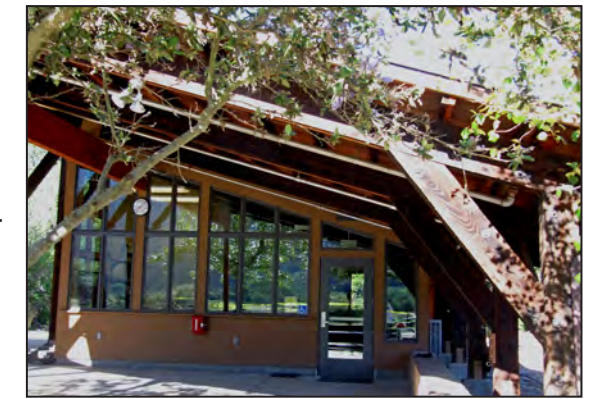
Garland Park Interpretive Center

Garland Park is an easy-to-access gem in Carmel Valley that serves as a gateway to experiencing the Carmel River Watershed. Hundreds of people a week enjoy the outdoors and hike the trails through a variety of terrain and habitat in the 3,500 acre park. On April 19, the Monterey Peninsula Regional Park District (MPRPD) dedicated the first of several permanent visitor center interpretive exhibits at Garland. The first phase of restoring the Drought Resistant Native Plant Demonstration Garden was showcased and dedicated as well.