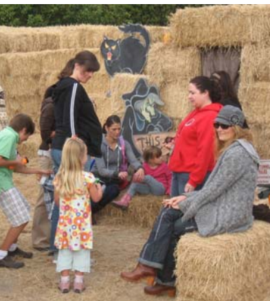
BELOW: Hallowe'en for CV school kids at Hacienda Hay & Feed