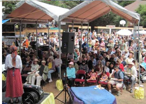
LEFT: Jewish Food Festival crowds watch a traditional wedding enactment at Congregation Beth Israel, Aug 29