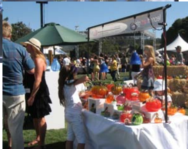
ABOVE & RIGHT: The huge CV Harvest Farm to Table Festival, in late Sep near Quail Lodge, featured wines, heirloom tomatoes, food, art and LOUD rock music audible for miles around