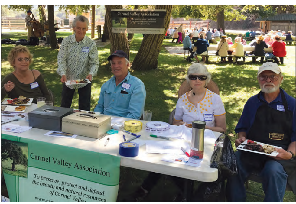
CVA board and committee members grab a bite while working the table

The CVA is happy to receive any suggestions about these three communication outlets and will do its best to address them promptly and professionally.