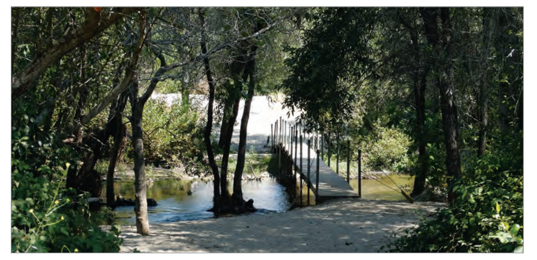
Carmel Valley River with foot bridge to the ball field.

Much of what we hear about water on the Monterey Peninsula and in the Carmel Valley has to do with questions of supply (is it sufficient for current and future uses) and cost (at what price and under whose control). Yet beyond these important, immediate concerns are deeper questions about water and soil quality, environmental and personal health. The next few issues of the Carmel Valley Voice will publish articles that examine some of these fundamental issues. These discussions reflect the expertise of individual members of the CVA Water Committee and are not to be taken as official committee or CVA statements. Rather, the aim is to provide a broad understanding of our shared water environment.