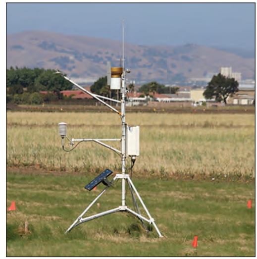
CIMIS station in Salinas.

Advocacy for relocation and recommissioning of the station, coupled with an effective outreach program to teach local growers and residents how to use the information, should be a CVA priority. CIMIS station data provide the foundation for conservation throughout the state and are essential to help bring science to the estimation of the Valley's water balance and thereby to reduce the draw on Carmel Valley groundwater. It is well known that local, residential well owners are the only group in the greater Monterey area not to have reduced water consumption during the drought.