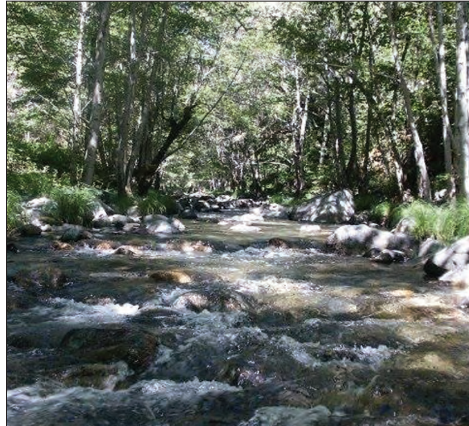
'Carmel River As It Should Be' by Will Colas

such as the appropriate sale price of the land, whether the county requires sharing of tax revenues from the project, whether the County will give its water allocation in Fort Ord to the project, and which jurisdiction will maintain the infrastructure. These are serious questions with enormous implications. The good news is that the county seems to be in no hurry to negotiate with Seaside. The supervisors appear to understand that this project, while moving through the process, still has numerous hurdles to overcome such as legal action by the opponents. Negotiating with Seaside now is too soon.