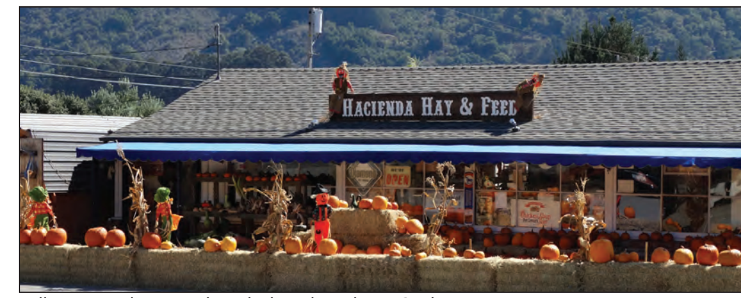
Fall at Hacienda Hay and Feed

The Carmel Valley Association will continue to provide vigorous opposition to this project because it would do serious harm to both the safety of our residents and the quality of life of our community. We hope you will join us in opposition.