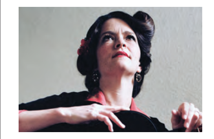
Sunday December 13, 2:30 p.m. Cascada de Flores ravishingly reimagined Mexican & Cuban traditional music

TICKETS 659-3115 hiddenvalleymusic.org 104 W. Carmel Valley Rd