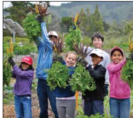
Student volunteers helping hands in MEarth's org

Have you ever driven down Carmel Valley Road, past Carmel Middle School (CMS) and wondered to yourself, what is that garden, grassland and new building all about?