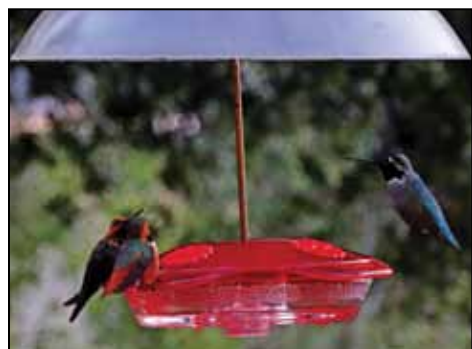
Rufous and Anna's hummingbirds

For more information visit www.westcoastfarmersmarkets.org/