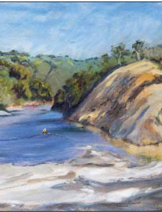
Painting and photo by Paola Berthoin