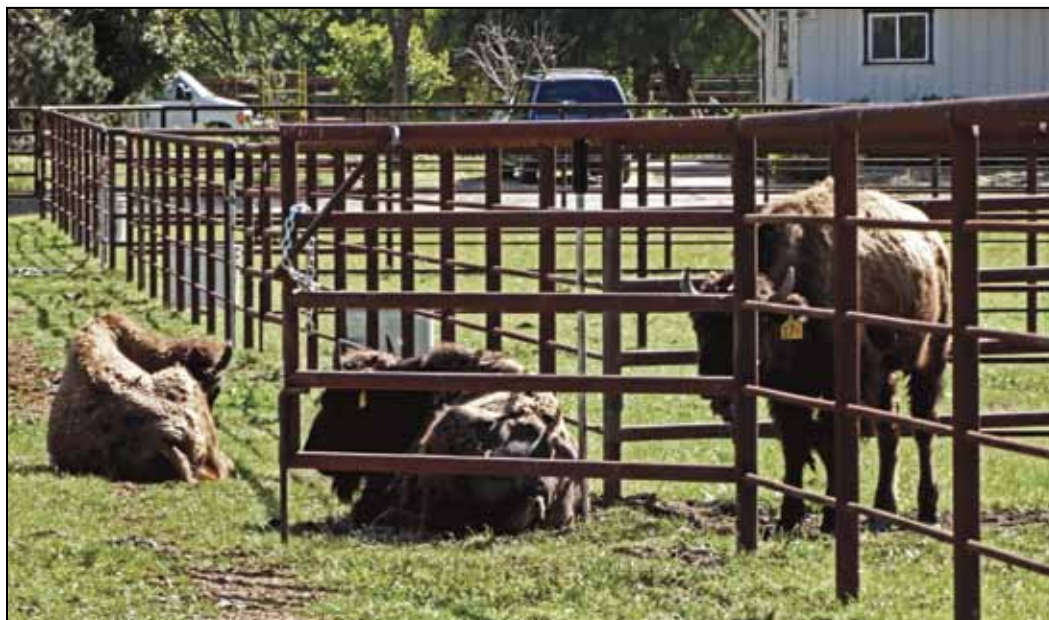
Bison beside Carmel Valley Road