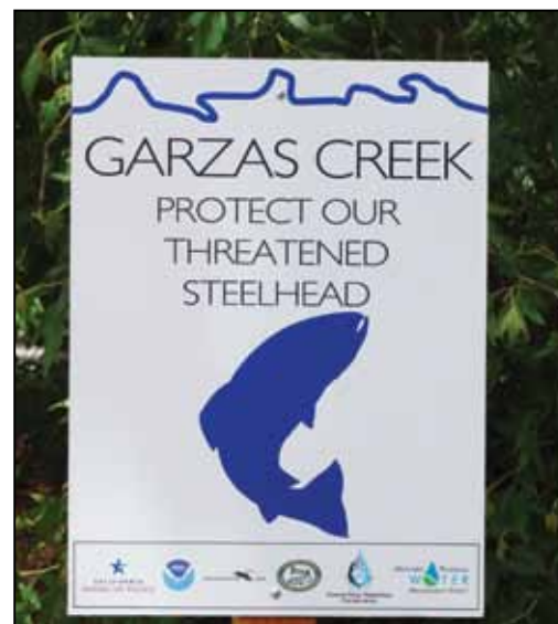
The steelhead signage program is expanded to more sites entering the watershed.

From Colored Town to Pebble Beach by Pat Duvall (2014).