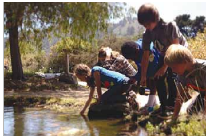
Kids explore the Habitat's pond during MEarth's summer camp

In the meantime, please check out our website: www.MEarthCarmel.org or follow us on Facebook.com/MEarthCarmel .