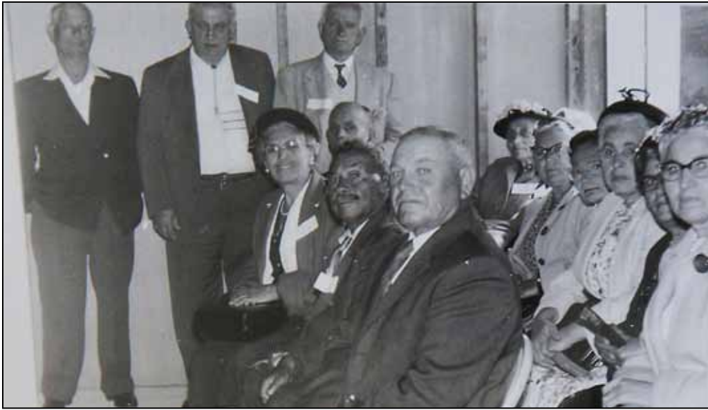
Some of the early Monterey Italians Who Were Displaced

Did you know that Italian and German nationals, not just the Japanese, were targeted for relocation and limitations during World War II? All three groups were branded as “enemy aliens,” the Italians in late December 1941. While information of the treatment of the Japanese is well-known and was much more severe, the public is less aware of the impact on the other two groups. They were fingerprinted, photographed, registered, and made to carry ID cards. Their cameras, radios, and firearms were confiscated. Any non-U.S.-citizen Italians could not live, work, or travel within five miles of the coastline. They had curfews as well as travel restrictions. Those on the West Coast were especially targeted. About sixty families around Monterey Bay, thousands in San Francisco, and 600,000 nationally were affected. Even the fisherman father of baseball great Joe DiMaggio, who had a 56-game hitting streak in 1941, was prohibited from fishing in the San Francisco Bay or visiting his son’s restaurant in the city.