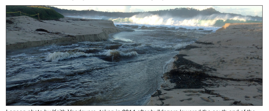
taken in 2014 after bulldozers lowered the south end of the bar just enough to ensure the river would breach it before homes began to flood.

Every other month a specific aspect will be offered on the second Saturday, building toward a whole experience of the watershed. The outings are open to children and adults. Our first outing will take place June 10 at the Los Padres Dam. Stay tuned for more information about this new program!