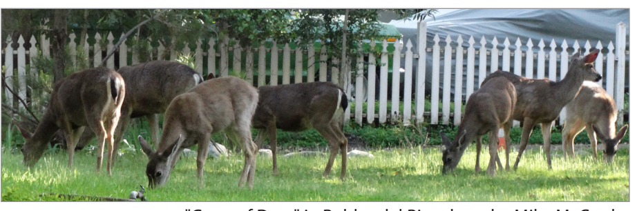
"Gang of Deer" in Robles del Rio, photo by Mibs McCarthy

While the ground is still moist, pull out or eradicate as best you can the yellow genista/ French Broom. The seeds live in the ground for 80 years and the plants set millions of seeds per year! The north side of Carmel Valley, in particular, is being exponentially overrun by it, destroying the native plants that bees and other animals depend on for habitat and food. It is also a fire hazard. It is the native habitats that make Carmel Valley the beautiful place it is. The example on the left is the blighted Robles del Rio Lodge.