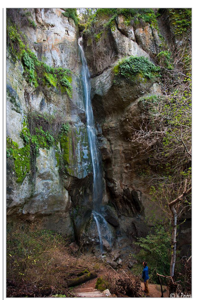
Garland Falls, a rare sight

FoRR has reactivated recently to advocate on behalf of residents, to assure the facility managers maintain a respectful atmosphere that allows our neighbors and friends to thrive.