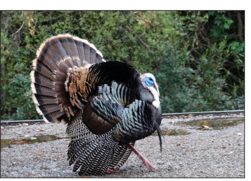
This tom turkey is stylin' and profilin'

Now Rippling River is a governmentsubsidized housing facility for disabled