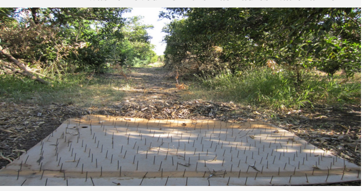
A nail-studded booby trap on a trail in Los Padres leading to an illegal marijuana garden

So what evidence does the Sheriff's Dept. have of marijuana gardens in CV and adjacent wilderness? "Last year the Sheriff's Dept. eradicated and destroyed approximately 149,000 marijuana plants from public and private properties," Miller was removed from the Las Padres National For-