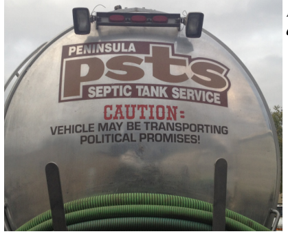
Left: Election season advisory

Below: Bleu and friend on the recently restored river trail east of Trail & Saddle Club