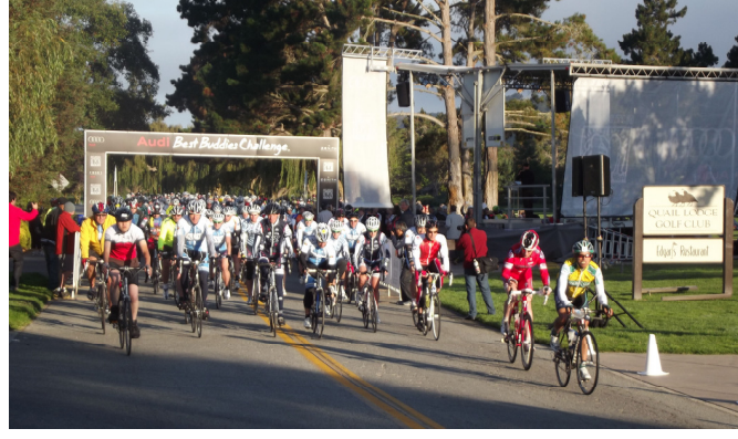
Above: 1200 riders participated in the Best Buddies benefit ride from Quail Lodge to Hearst Castle, Sept. 8