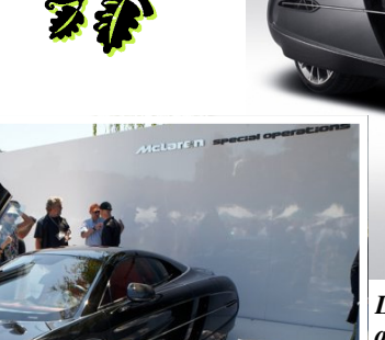
Left & above: The most talked about and photographed entry at the Concours d'Elegance, the 'one and only' McLaren X-1, built to unique specifications for a (very) wealthy British collector. A true 'one-off,' its custom design was said to have been inspired by 'classic car designs, a black and white photograph of Audrey Hepburn and an eggplant.'