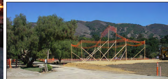
Calamity Farms at 550 W. Carmel Valley Rd. The netting shows the 30’ height limit.