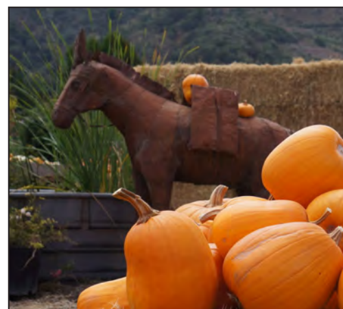
Hacienda Hay & Feed annual pumpkin patch

We, at Carmel Valley Association, continue to work to preserve, protect and defend the natural beauty, resources, and rural nature of Carmel Valley. We hope you will enjoy the articles in this issue of our newsletter.