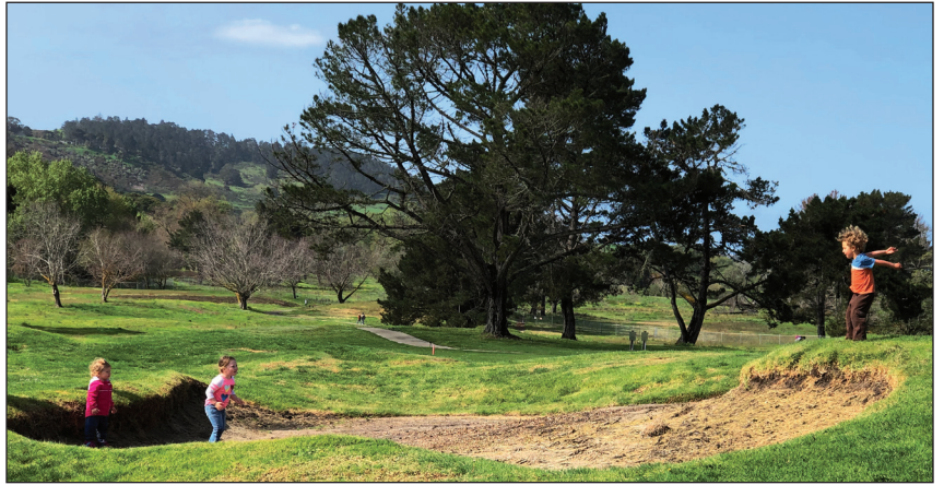
Carmel's new park enthusiasts turn sand traps into nature exploration. The March day included wildlife demonstrations, guided walks, and exhibits of current preservation efforts.