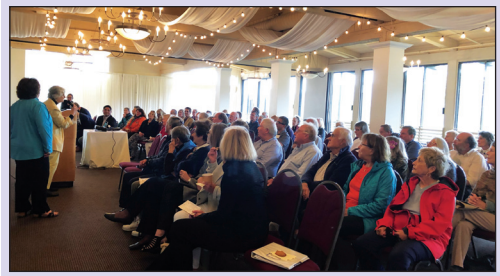
CVA's 70th Anniversary Annual Meeting, March 24, Palo Corona Regional Park. The topic was the Valley's role in addressing the housing crisis.

then separating sand from plastics using a density separator. She then examined the remaining material under a microscope and separated out plastic particles.