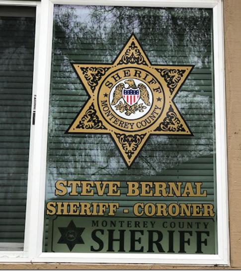
Is anybody home?

Sometimes Carmel Valley residents need a little help from their friends. If that help involves policing, those friends for Carmel Valley residents come primarily from the Monterey County Sheriff's Department. As one of Monterey County's more affluent areas, Carmel Valley contributes heavily to county budget, which was nearly $1.5 billion last year. During that time period, our Sheriff's Department's share of the county budget was $109,065,659.