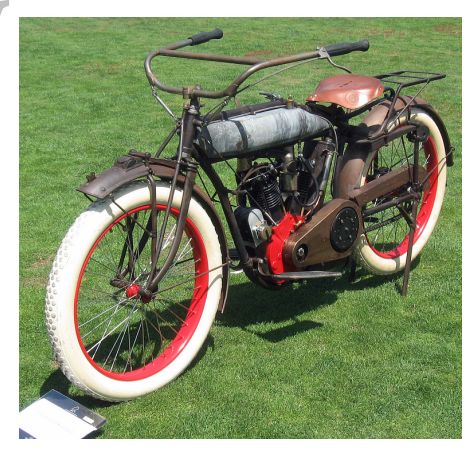
ABOVE: A 1914 Indian Standard, among antiques at the Quail Lodge Motorcycle Gathering, May 5 LEFT: Congregation Beth Israel celebrates the 25th anniversary of its popular Jewish Food Festival, Aug 26 DELOW, Cycenidente Bether Toff, benitten and