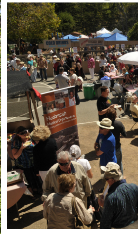
JFF photos l