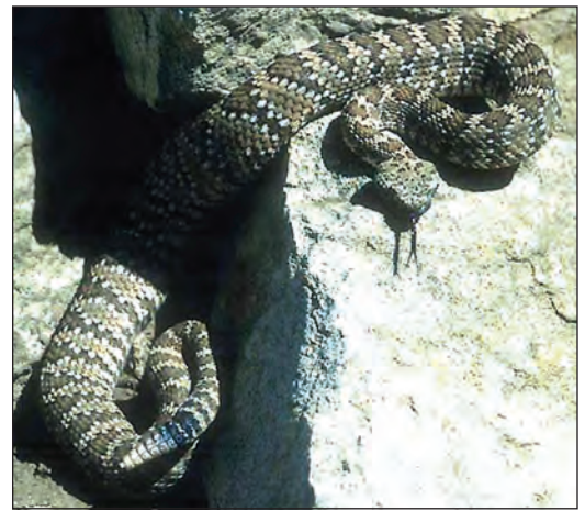
Rattlesnakes are more commonly seen in hot, dry weather.

They nourish the land and its inhabitants. They give a lot more than they take.