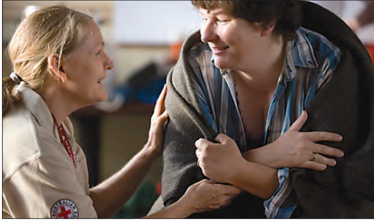
Red Cross photo

When the phone rings at 3 in the morning, most people panic. I don't. I'm a Red Cross Disaster Assistance Team (DAT) lead volunteer, so I know it's probably a disaster call. The dispatcher on the other end of the phone tells me that there is a fire. I jot down the details and contact the Incident Commander (IC) for an update before hopping in the car to proceed to the incident, which might be anywhere in the county. Once there, I check with the IC as to the damage and number of people needing help and begin, along with the rest of the team members called up from all over the county, dealing with the clients to assess their needs.