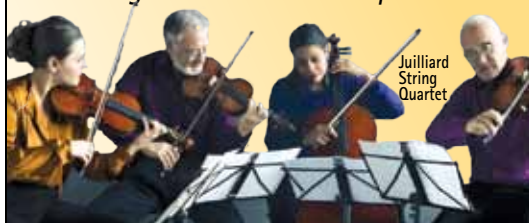
Juilliard String Quartet

Subscriptions on sale now. Single tickets available Sept. 10