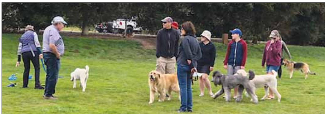
Valley dog families socialize