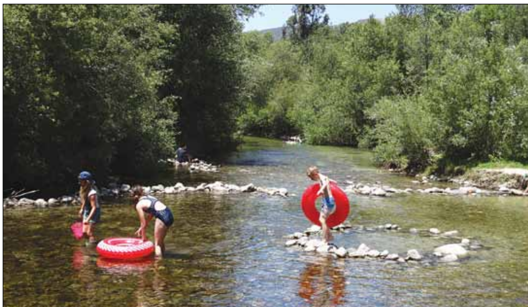
Carmel River fun