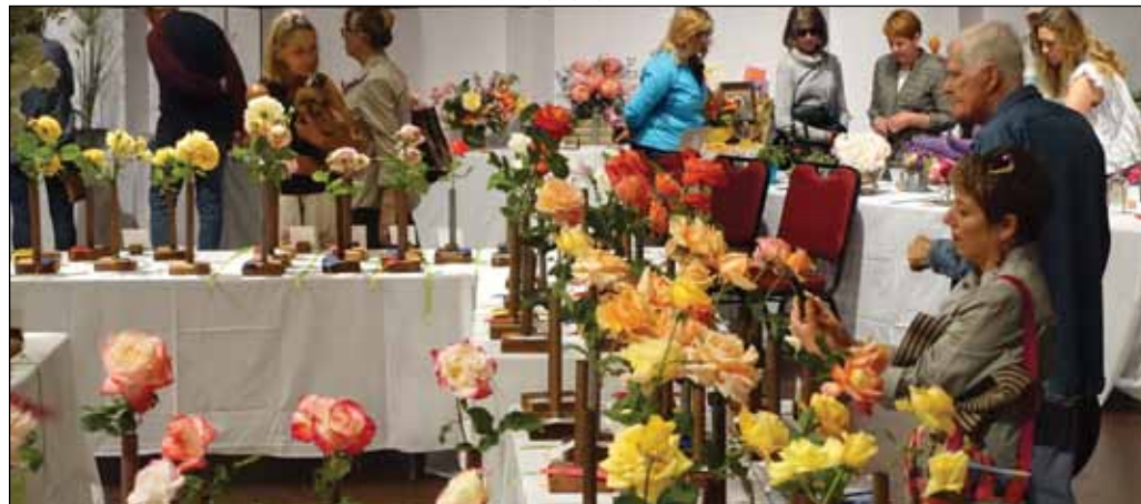
Carmel Valley Garden Show visitors enjoying roses

At roughly 180 years of age, the privately-owned and restored Boronda adobe still stands, just off Boronda Road. The road was named to honor Carmel Valley's first pioneer family, who ventured far inland to establish a home on their Rancho los Laureles grant.