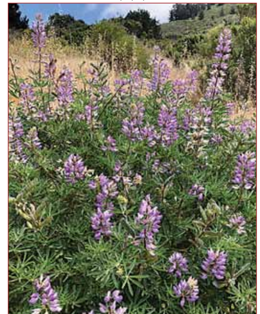
Bush lupine in Palo Corona Regional Park