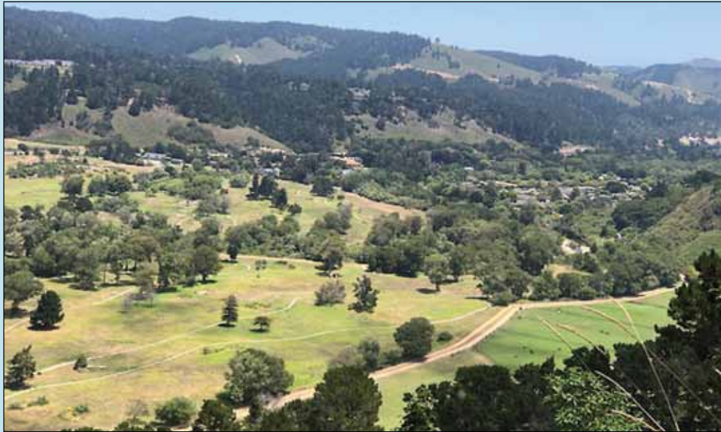
CV View from Inspiration Point trail in Palo Corona Regional Park

CVA Legal Defense Fund. Our Legal Defense Fund is a special member-supported fund, over and above membership dues, that we use exclusively to wage the battles to ensure that the county follows the laws that prevent over-development, reduce traffic, and protect the critical natural resources and rural character of Carmel Valley.