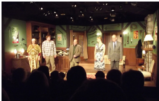
Above: Cast of Deathtrap in Magic Circle production on Nov. 25, taking curtain call.